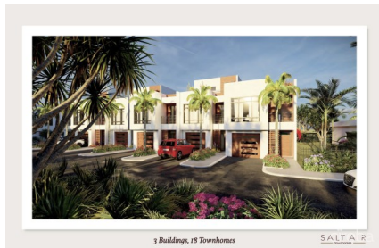
3 Buildings, 18 Townhomes