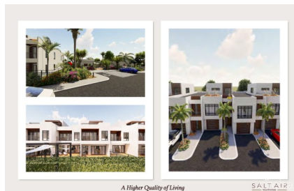
A Higher Quality of Living