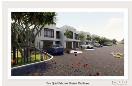
Your Quiet Suburban Oasis in The Shores