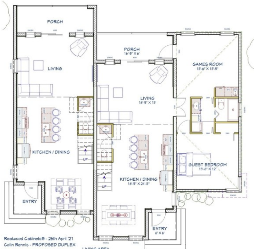
Realwood Cabinets® - 26th April '21 Colin Rennis - PROPOSED DUPLEX Passion Circle Lookout Gardens, Bodden Town, Grand Cayman