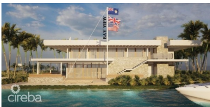
The Sports and Leisure Facilities Plan